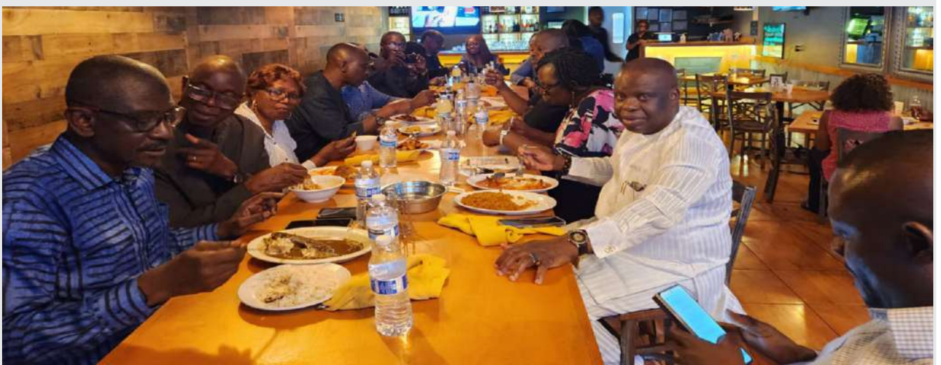
2024 International Biennial Conference Houston