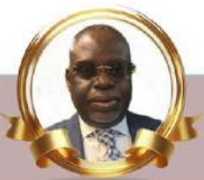
Prince Debo Akande, FCIB - Ex-Officio