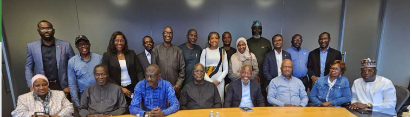
Courtesy visit to Unity National Bank of Houston in 2024