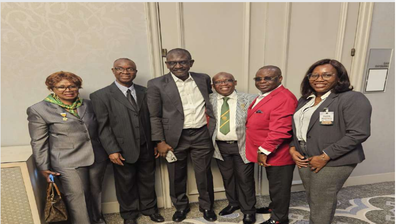
2024 International Biennial Conference Houston