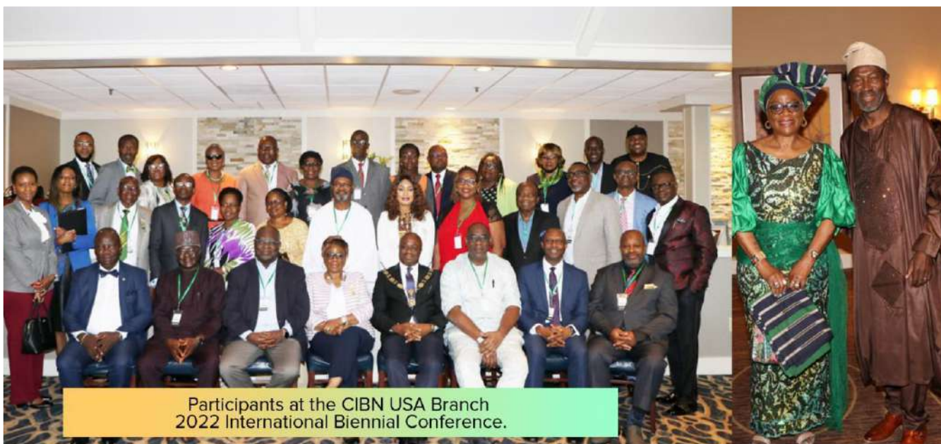
Participants at the CIBN USA Branch 2022 International Biennial Conference.