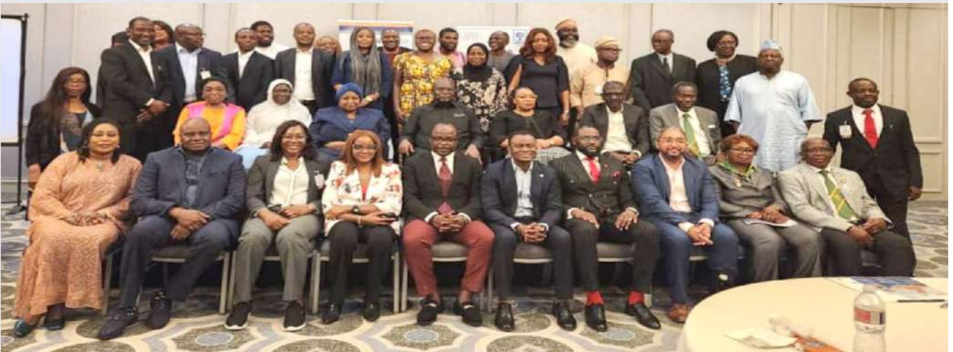
2024 International Biennial Conference Houston